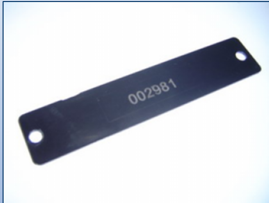
UHF Passive Pallet/Container Tag

UHF Passive Pallet/Container Tag is compliant with the EPC Class 1 Gen 2 and ISO18000-6C. The frequency used for ultra high frequency UHF RFID systems is 860-960MHz for UHF.