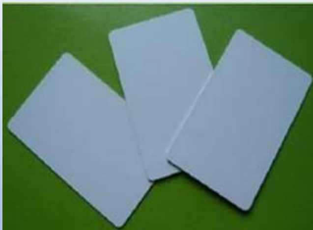
TUC-001: UHF Blank White Card (High Performance)